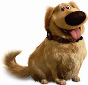
"UP" Dug