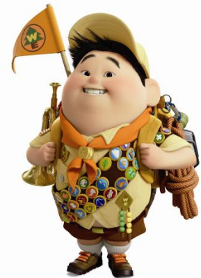
"UP" Russell

This film has advertising approval. Check the classification closer to the release date.